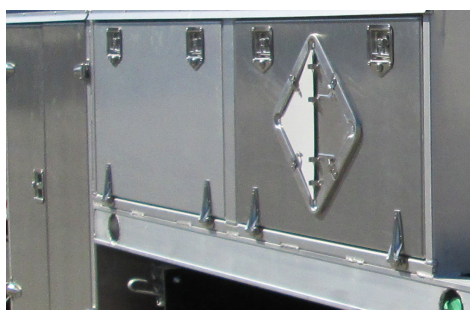
STORAGE BOXES STORE TOOLS AND FITTINGS SECURELY

Integrated tank cradle inserts with aluminum tank cradles allow cradle storage when not in use, and quickly moved into place for two 500 gallon tanks or one 1000 gallon tank. Rubber composite flooring made from 100% recycled goods provide excellent traction and ensure longevity.