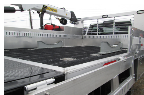
MULTIPLE TIE-DOWN OPTIONS MOVE ALL TANK SIZES WITH ONE TRUCK

LED lights standard for all recessed stop, turn, and back-up lights ensure other drivers will see you. Three LED flood lights in the bulkhead, and two LED adjustable flood lights allow safe working conditions even when visibility is low.