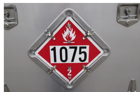
FLIP SAFETY PLACARDS MEET DOT REGULATIONS

Drivers side storage boxes with adjustable shelving and LED interior lighting provide secure storage out of the elements. Steel block storage box with openings for mud and rocks to fall through allow block storage crucial for tank setting.