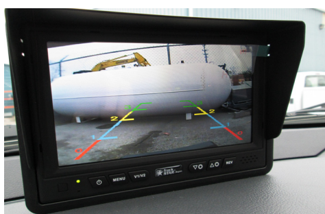
CLASS V RECEIVER | COLOR BACKUP CAMERA INCREASED VISIBILITY AND SAFETY

Flip safety placards are located on all sides of the vehicle in addition to a 20lb fire extinguisher ensure proper DOT compliance.