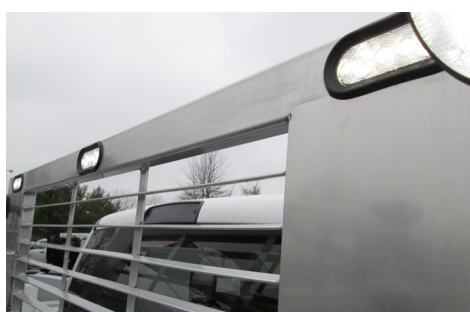
LED LIGHTING LESS MAINTENANCE AND MORE VISIBILITY

Class V receiver hitch with plug standard to allow for towing when needed. Color back-up camera allows for safe and easy backing even while carrying propane tanks on the bed.