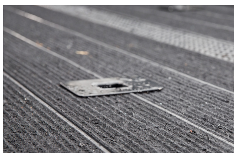
TANK CRADLE INSERTS | FLOORING PROVIDES SAFETY IN ANY WEATHER

Integrated tank cradle inserts with aluminum tank cradles allow cradle storage when not in use, and quickly moved into place for two 500 gallon tanks or one 1000 gallon tank. Rubber composite flooring made from 100% recycled goods provide excellent traction and ensure longevity.