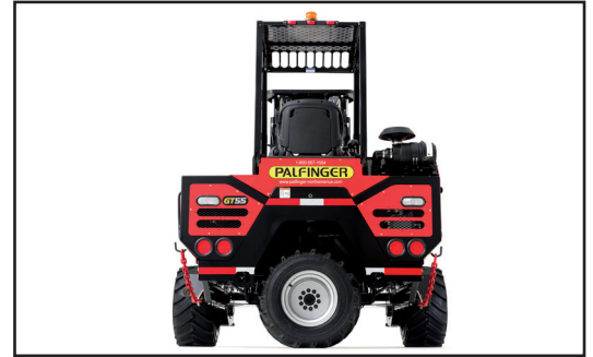
15" of Ground Clearance